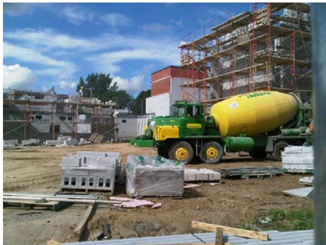
The students & staff of Monsignor Gleason / St. John CES are eagerly anticipating the re-built St. John CES as construction moves along nicely on Strange St. in Kitchener.

Ontario EcoSchools is an environmental education program for grades 1-12 that helps students develop ecological literacy while engaging in practices to become environmentally responsible citizens. This is a perfect fit with the philosophy in Waterloo Region's Catholic Schools that sustainable development means " meeting the needs of the present generation without compromising the ability of future generations to meet their own needs. "