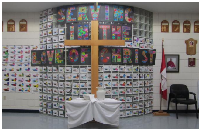
Special Catholic Education Week display at St. Elizabeth CES .