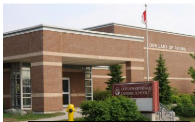
Our Lady of Fatima CES

www.wcdsb.ca/about/accom/SEGalt/index.html